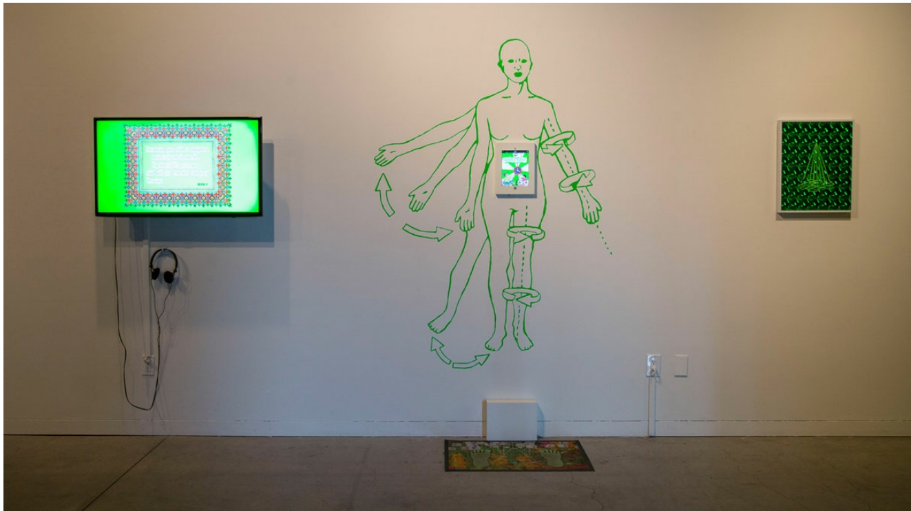
Umber Majeed, 'Untitled,' 2019–20; digital publication interactive installation.( Courtesy the artist and Southern Exposure )

Notably, the curators made a deliberate choice to minimally contextualize the show. There's no extensive writing on the wall about each country's geo-political history or relationship to the United States' current administration. (For the latter, one need only follow the news generated by this country's mercurial president.) Instead, gallery-goers are thrust inside thousand-year-old myths about Islamic spiritual figures and the artists' modern interpretations of them. It's an approach that reframes where a story can start, instead of centering itself on the knowledge, or lack thereof, of American audiences.